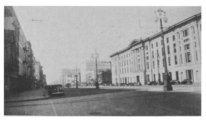
A view of Canal Street, New Orleans.

Shortly after January, when other sections of the country are covered with snow, more than fifty miles of New Orleans streets and boulevards are multi-colored with fresh azalea blooms. In City, Audubon and other parks, along the lake front and in other parts of the city is scenic beauty unmatched elsewhere in this country.